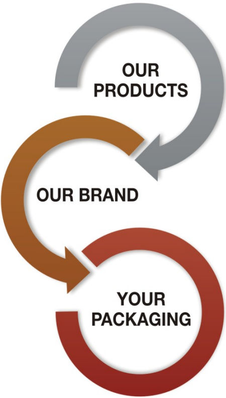
OPTION - A