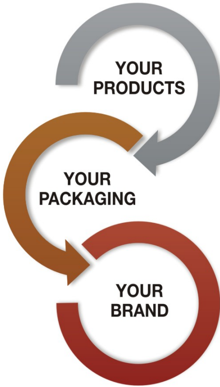
OPTION - C